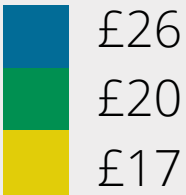
Blocks F & G: